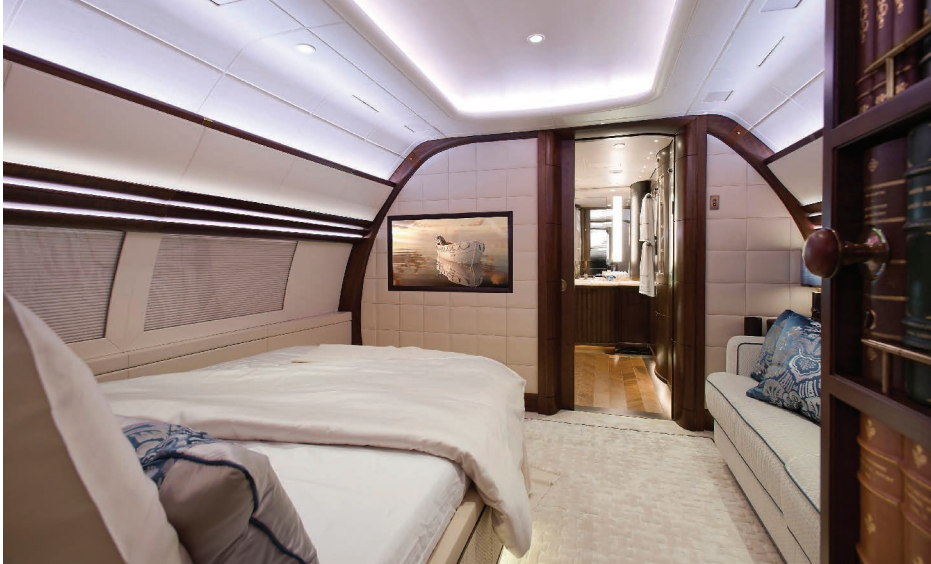
• AIRBUS ACJ319