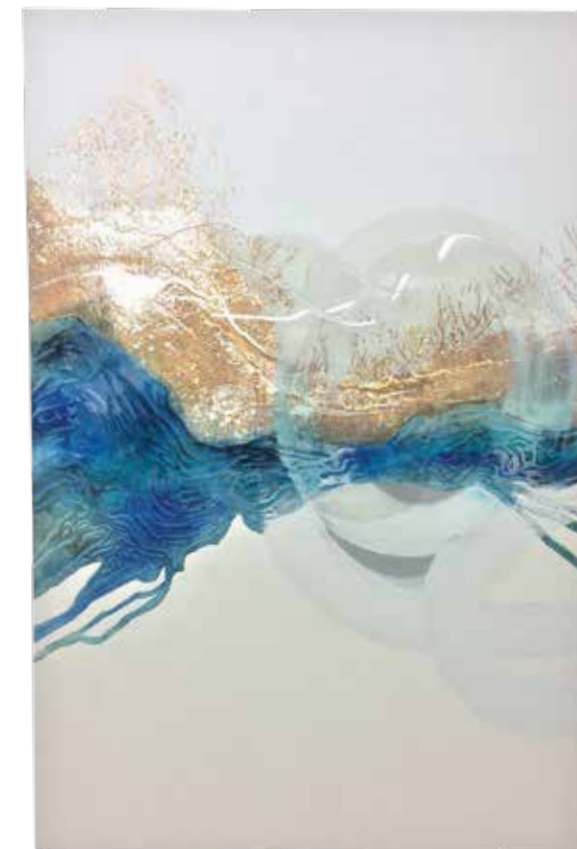
Works from the Matisse Cut-Outs collection (above and opposite) and a commissioned work by Luminaire Arts, a London art consultancy (left).