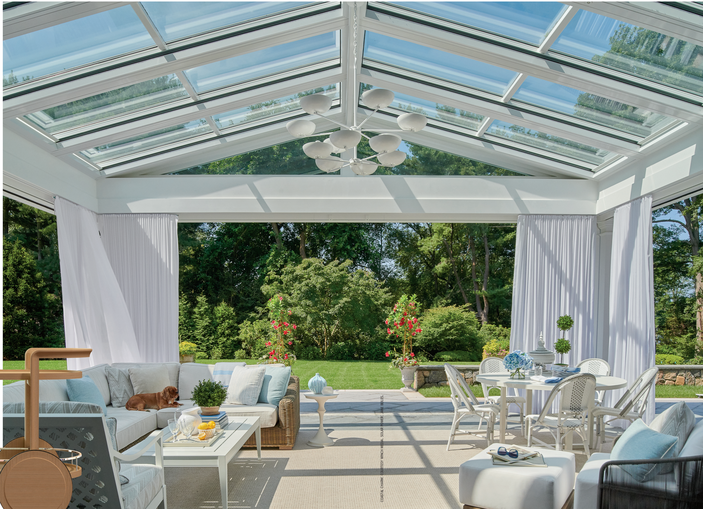
COASTAL CHARM: COURTESY WINCH MEDIA; SOLAR POWER: JANE BELLES.